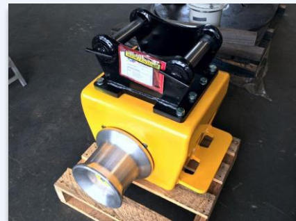
Quick-Hitch Capstan Winch with Adapter