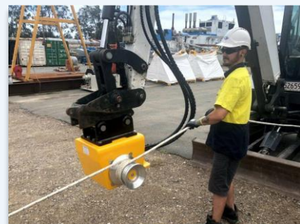
Quick-Hitch Capstan Winch in Operation