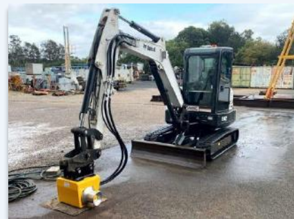
Quick-Hitch Capstan Winch Mounted on an Excavator