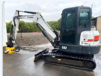
Easy to Attach and Remove