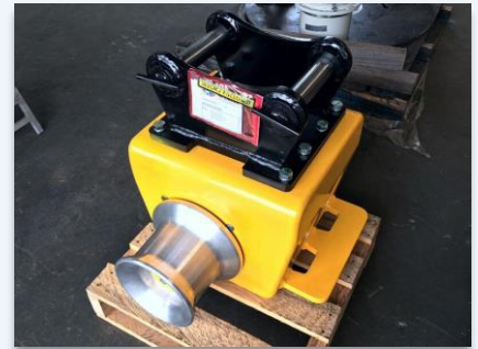
Quick-Hitch Capstan Winch with Adapter