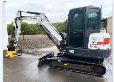
Easy to Attach and Remove