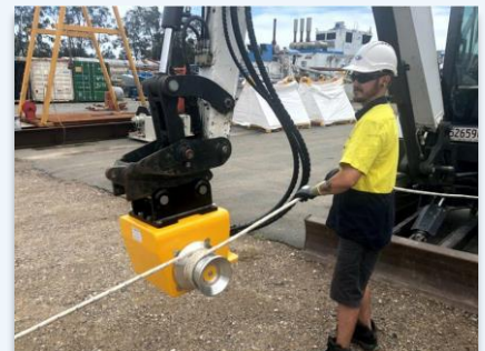
Quick-Hitch Capstan Winch in Operation