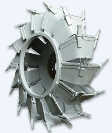
1500mm Dia. Dredge Bucketwheel Cutter