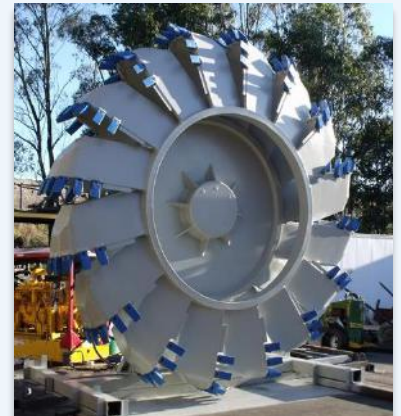
1800mm Dia. Dredge Bucketwheel Cutter