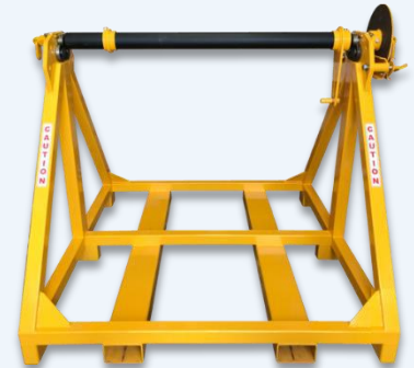
12 Tonne Cable Drum Stand Fully Fabricated and Welded