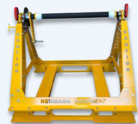
5 Tonne Cable Drum Stand Bolt Together Style