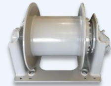
Basic Lift Winch