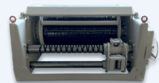
Lift Winch with Arc Screw Wire Guide