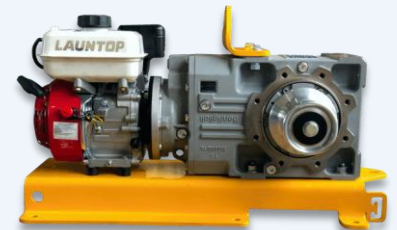
PPCW2000 – 2 Tonne Portable Petrol Capstan Winch