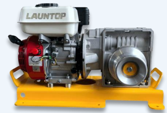
PPCW1000 – 1 Tonne Portable Petrol Capstan Winch