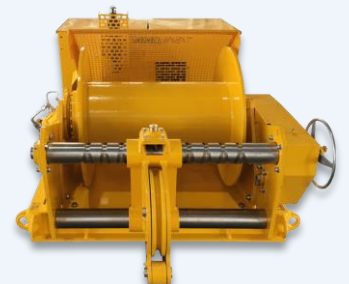
Hauling Winch with Hydraulic Powerpack and Archimedes Screw Guide