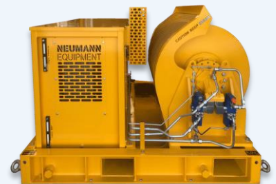
Units are Self-Contained on a Bundled Base