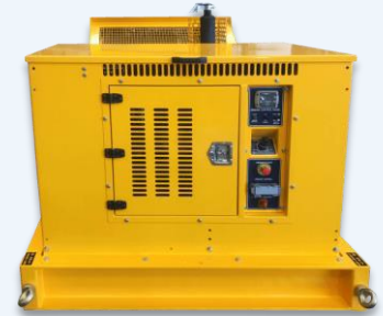
Hydraulic Powerpack Assembly